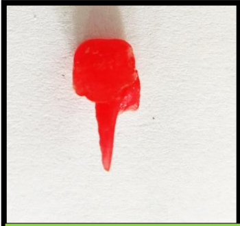
Customized post and core of pattern resin