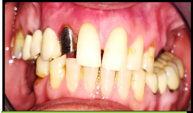
Insertion of casted post and core (frontal view)