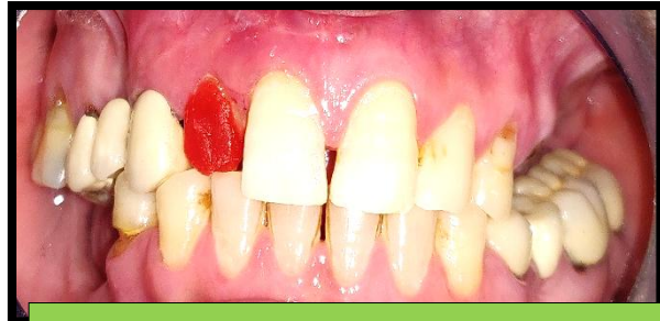
Frontal view of customized pattern resin post and core