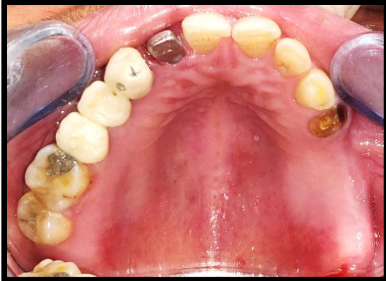
Insertion of casted post and core (occlusal view)