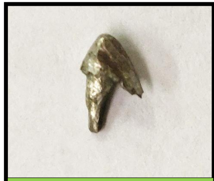
Casted post and core