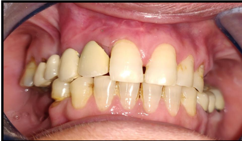
Final PFM prosthesis