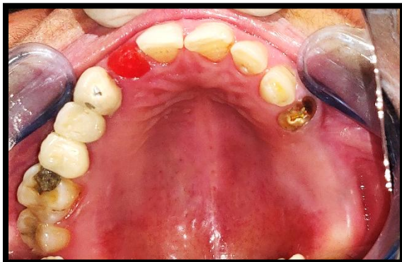
Occlusal view of customized pattern resin post and core