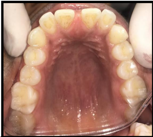
MAXILLARY OCCLUSAL VIEW (PRE-OP)