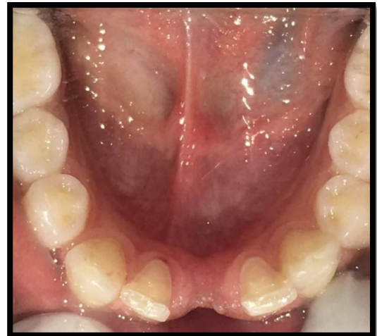
MANDIBULAR OCCLUSAL VIEW (PRE-OP)