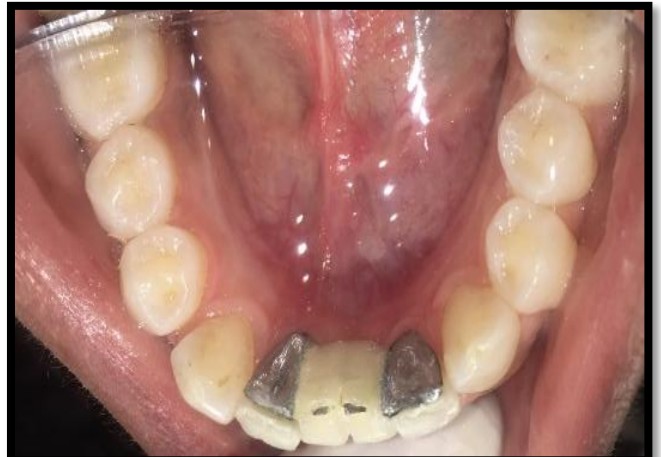
FINAL RESTORATION (OCCLUSAL VIEW)