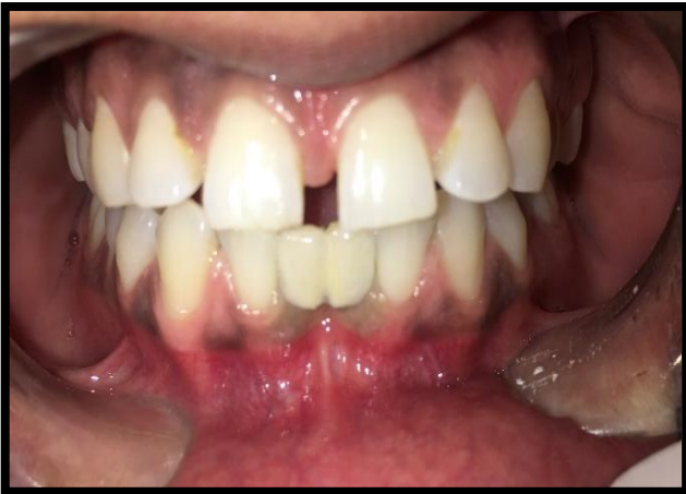
FINAL RESTORATION (LABIAL VIEW)